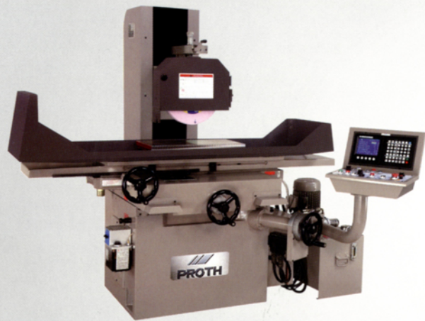
PSGS - 3060BH